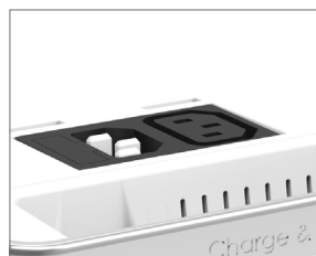
Powered with a mains lead