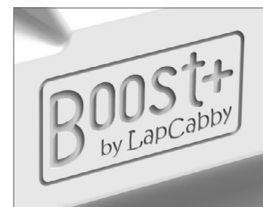
Engraved logo design