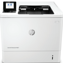
HP LaserJet Enterprise M607dn