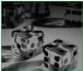
2000:1 Contrast Ratio

Add more depth to your image with a high contrast projector; with brighter whites and ultra-rich blacks, images come alive and text appears crisp and clear - ideal for business and education applications.