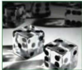
20,000:1 Contrast Ratio