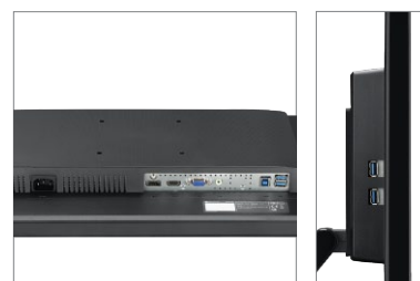
Versatile connectivity: VGA, HDMI, DisplayPort and USB port allow for effortless system integration