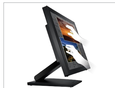
Integration of 10-point touch and projected capacitive touch technology provides accurate and precise touch experience