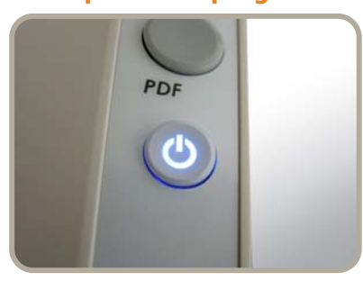
Function button design for Scan, OCR, PDF and Email