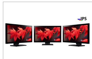
IPS panel provides superb clarity from all viewing angles