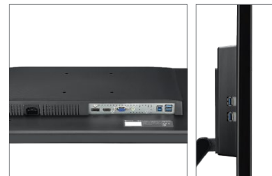
Versatile connectivity: VGA, HDMI, DisplayPort and USB port allow for effortless system integration