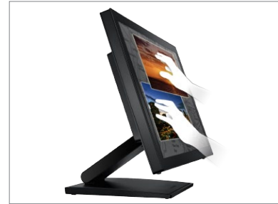
Integration of 10-point touch and projected capacitive touch technology provides accurate and precise touch experience