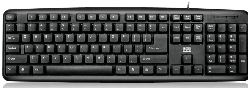
General Purpose full-size UK keyboard