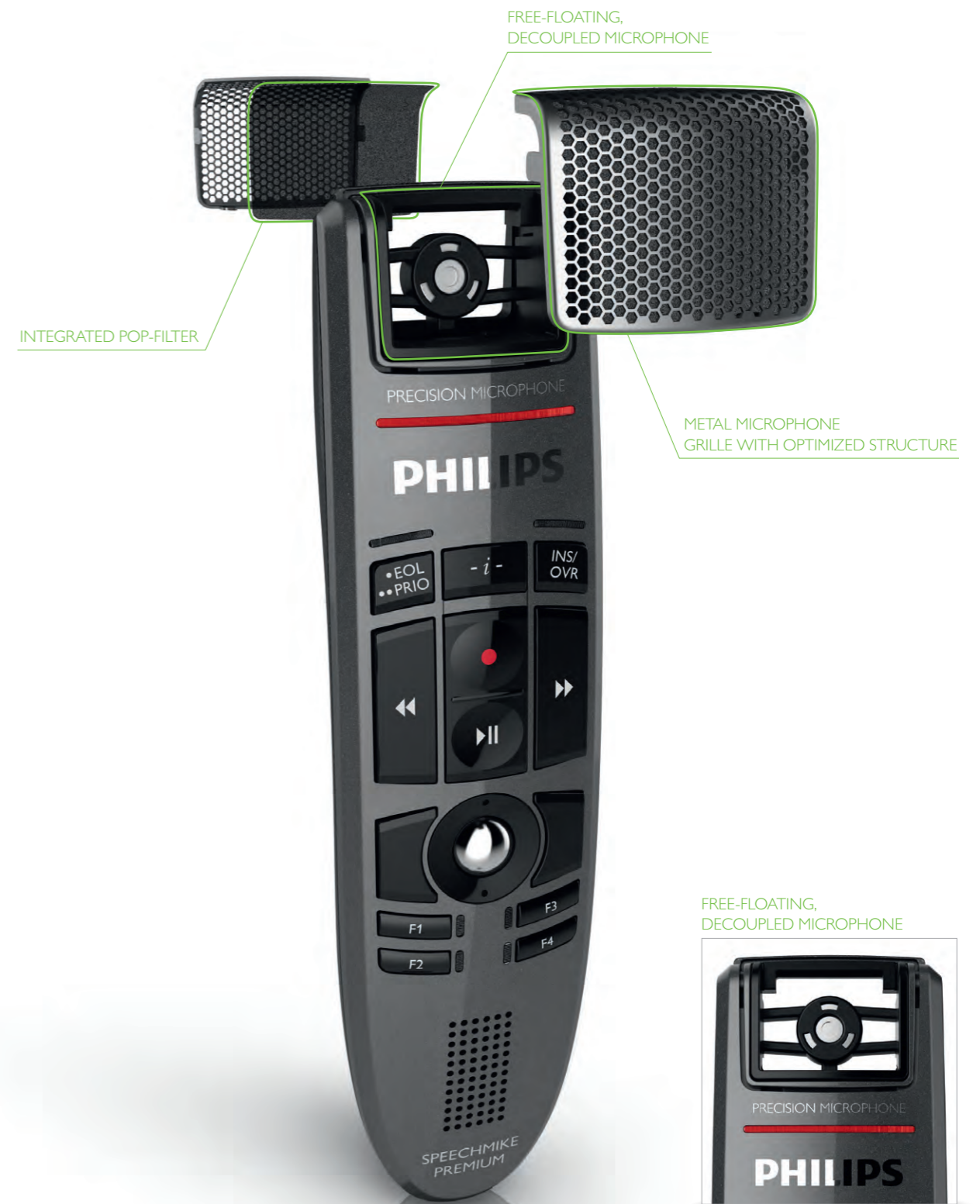
FREE-FLOATING, DECOUPLED MICROPHONE