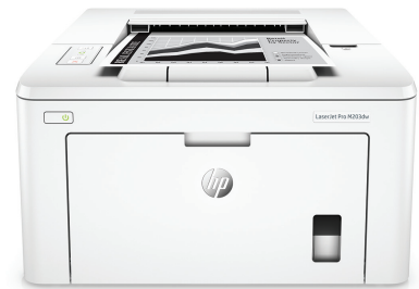
HP LaserJet Pro M203dw Printer