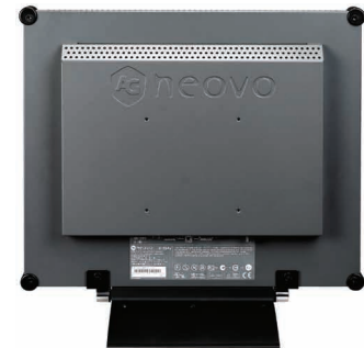
Front-panel keypad with Input Select, Screen Menu, Contrast and Brightness controls for quick adjustments