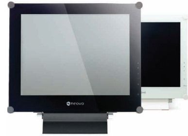
Available in black or white