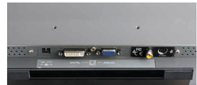
Wide range of I/O connectors for flexibility and expandability in endoscopic video installations