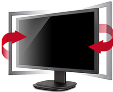
Swivel: 360 degrees