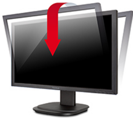
Tilt : -5 ~ 20 degrees