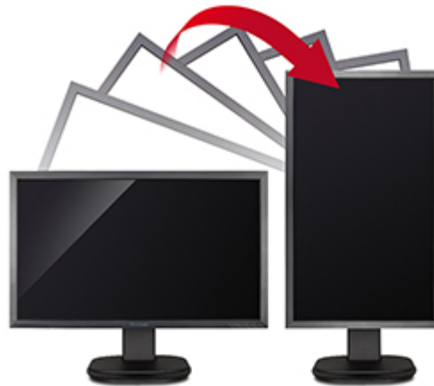
pivot: 90 degrees