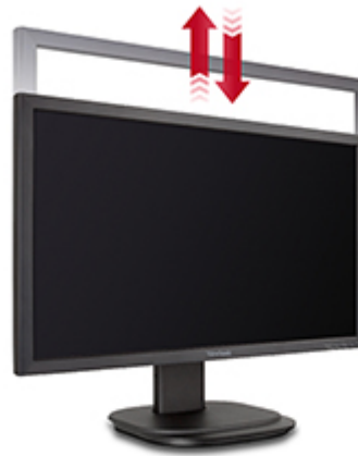
Height Adjust : 0~135mm