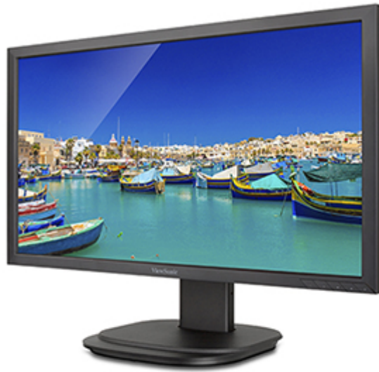
ViewSonic Flicker-Free Technology