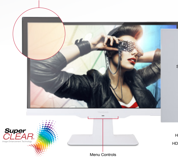
Frameless Design (Bezel Beneath the Glass)

The VX2363Smhl-W features a frameless edge-to-edge glass faceplate with an ultra-slim bezel beneath the glass. With its sleek, eye-catching design, this elegant IPS monitor looks as good as it performs.