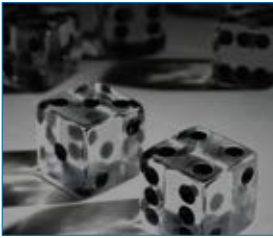
2000:1 Contrast Ratio

Bright 3000 ANSI Lumens, Perfect for projecting in lights on environments. And with DarkChip3™ technology from Texas Instruments combined with Eco+ technology produces a stunning 13,000:1 contrast ratio for pin sharp graphics and crystal clear text. Crisper whites, ultra-rich blacks make images come alive and text easier to read - ideal for business and education presentations.