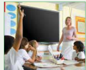
Eco AV mute on 30% Power consumption