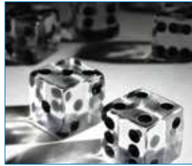
13,000:1 Contrast Ratio