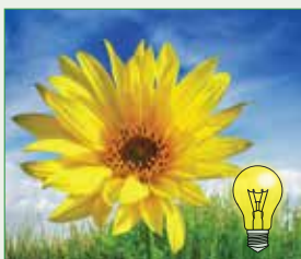
Bright scene ~100% Power consumption