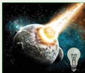
Dark scene ~ 30% Power consumption