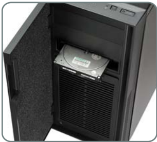
■ External SATA X-dock