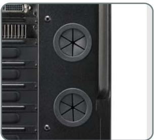
■ Rear retaining hole for water cooling kit