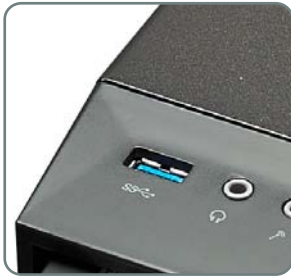
■ USB 3.0 (USB 2.0 backwards compatibility)