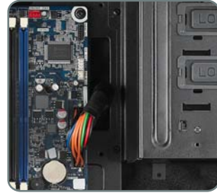
■ Improved cable management