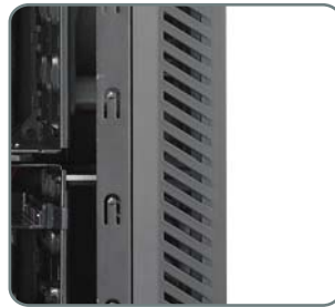
■ Ventilation Design