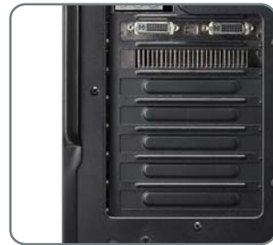
■ 7 expansion slots