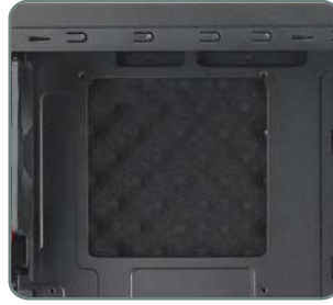
■ CPU retaining hole for easy customizability