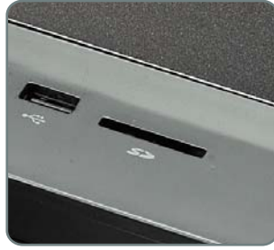
■ High Speed SD card reader