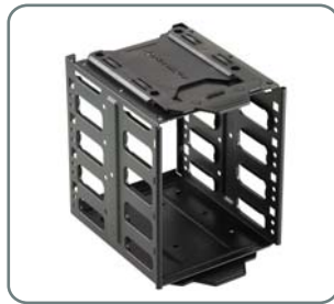
■ Removable HDD cage