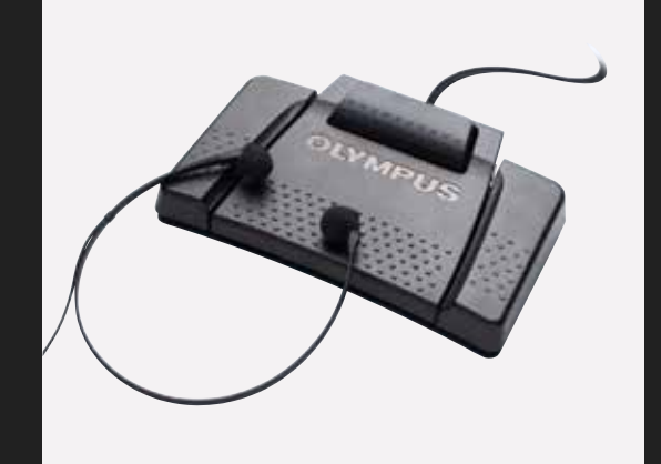
AS-9000 includes RS-31H, E-102, ODMS Transcription Module (Single License)