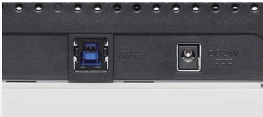
High speed performance through USB 3.0 interface

All four scanner models additionally make use of an ultrasonic sensor that accurately detects multifeed errors where two or more sheets are fed through the scanner at once plus the Intelligent Multifeed Function allows document scan parameters to be applied which enables the sensors to be set up to help identify and subsequently ignore attachments such as sticky notes or items with a photo attached that would otherwise cause disruptions to the scanning process.