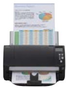
fi-7180 and fi-7160