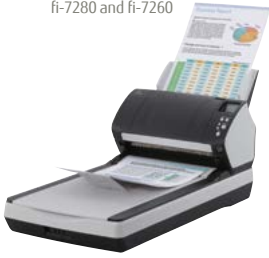
fi-7280 and fi-7260

fi-7160 / fi-7260 – A4 Portrait at 300 dpi 60 ppm / 120 ipm fi-7180 / fi-7280 – A4 Portrait at 300 dpi 80 ppm / 160 ipm Scan mixed batches up to 80 sheets