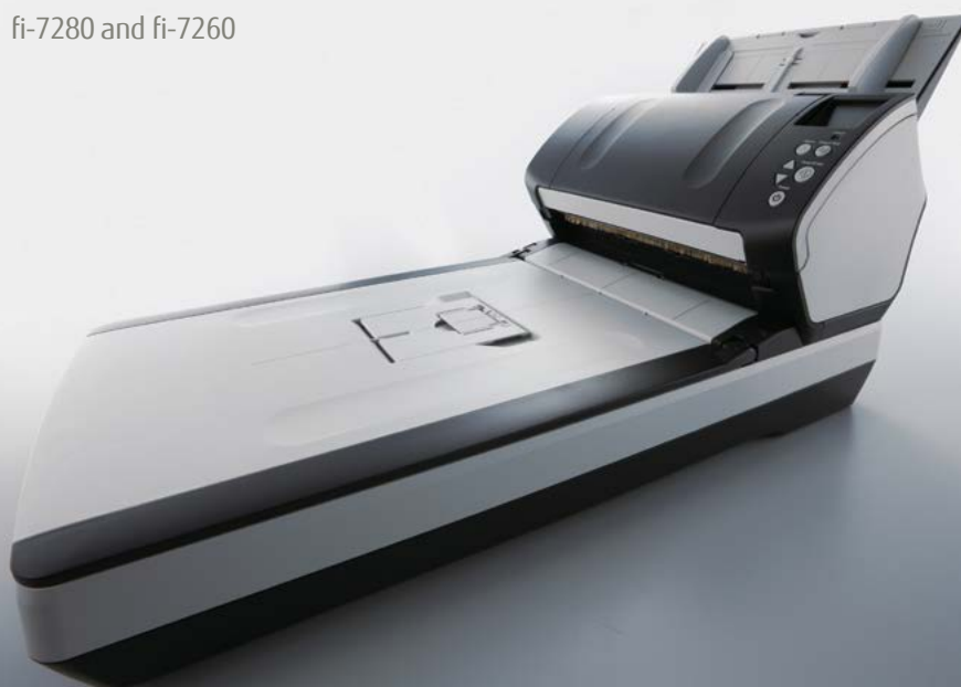
fi-7280 and fi-7260