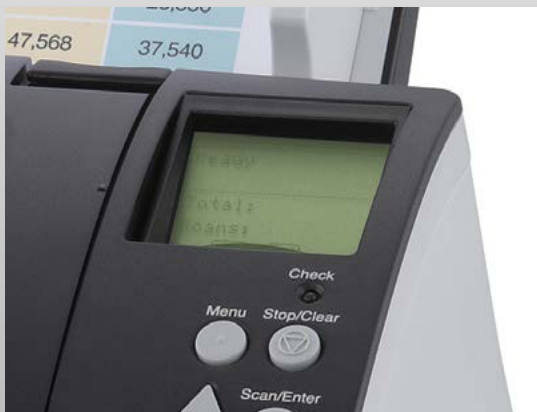
Integrated LCD operating panel

Scanner Central Admin software enable Fujitsu scanners to be managed and maintained from a single location to minimise scanner downtime anywhere on the global system.