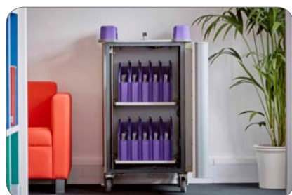
LapCabby Mini 20V