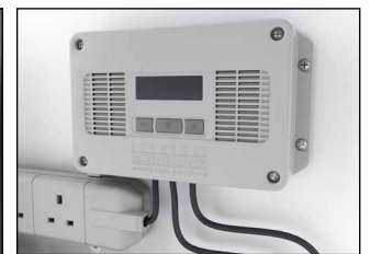
Power7 - Power Management System