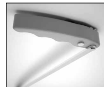
Concealed Back Door Release