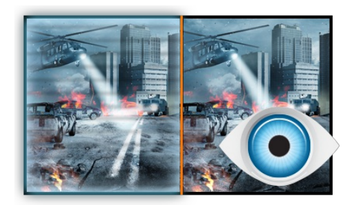
Flicker-free + Blue light

IPS technology offers higher contrast, darker blacks and much better viewing angles than standard TN technology. The screen will look good no matter what angle you look at it.