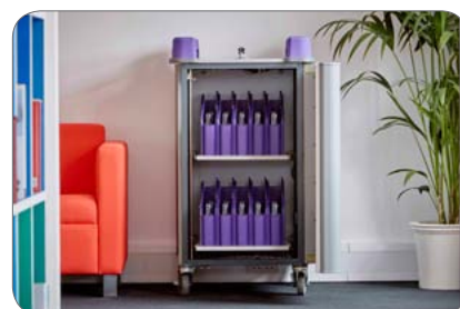
LapCabby Mini 20V