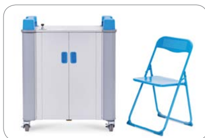
TabCabby 32H Compact