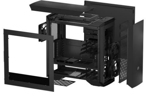
FreeForm Modular System: Customize, Adjust, Upgrade your case with our MasterAccessories