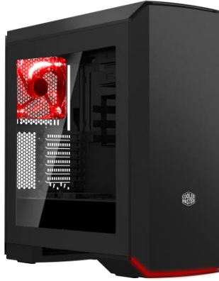
Red Led fan and front bottom light